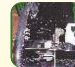
Radiator with Overflow Reservoir