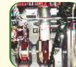
Oil Jet for Piston Cooling