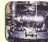
Dry Type Air Filter